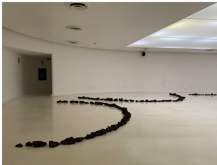
Examples of rocks and delimitation of the space for each dancer