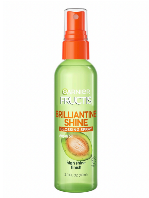
Glossy spray for hairstyling