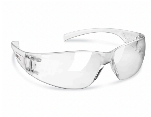
Clear eye protection plastic glasses to be provided to the public